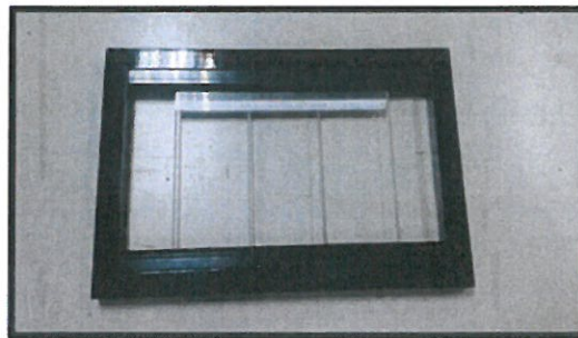
Photograph 1 : Show Sample Received